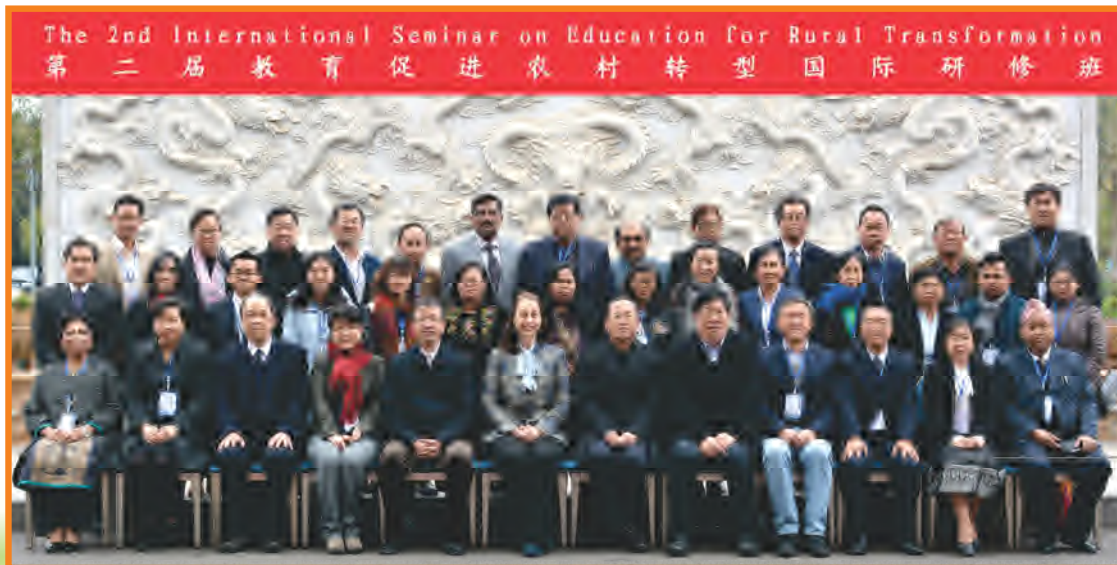
Group Photo of the 2nd International Seminar on Education for Rural Transformation, Kunming China