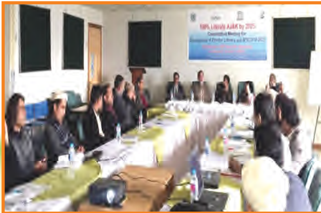
AJ& K forum meeting for drafting of NPA at Muzaffarabad

As regards the National Plan of Action the workshop participants were informed that Provincial Literacy plans are to be developed by the respective provincial and area organizations while NCHD, UNESCO and JICA AQUAL will extend technical assistance. NPA will be compiled, based on the provincial, and area Literacy Plans. In this connection NTI team visited provinces and conducted provincial forum meetings including education department officials, INGOs and NGOs for the preparation of provincial drafts.