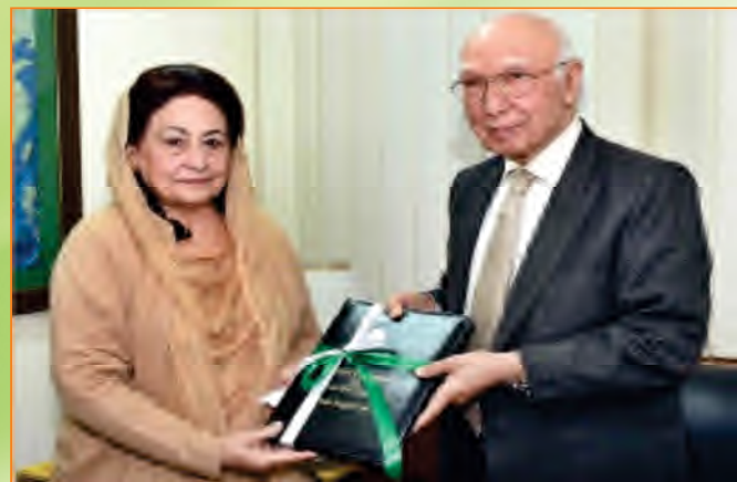
Chairperson NCHD presenting Annual Report to Federal Minister of Education Eng. Baligh ur Rehman and Deputy Chairman Planning Mr. Sartaj Aziz