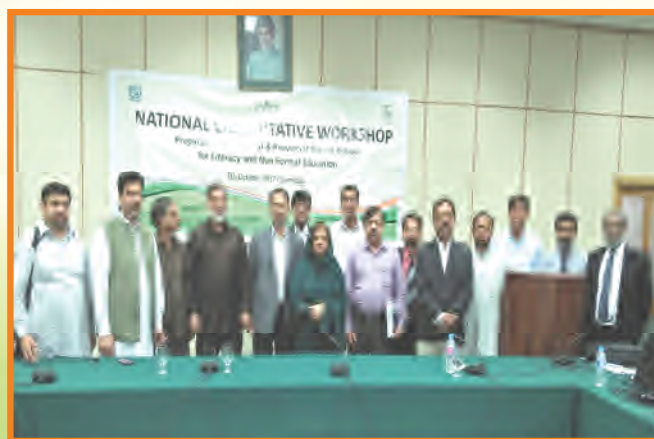
Group photo of the NPA Team including experts of NCHD