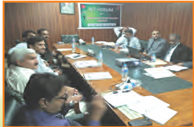
ICT forum meeting for NPA at Academy of Education Planning and Management, Islamabad