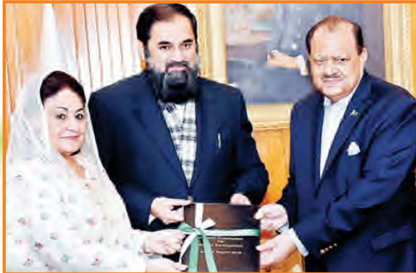
Chairperson NCHD presenting Annual Report to president of Pakistan

Annual Report of NCHD 2016, which includes activities, achievements and innovative approaches of NCHD being practised in the remote areas of the country, was presented to different dignitaries. Chairperson NCHD held a meeting with honorable President of Islamic Republic of Pakistan, Mr. Mamnoon Hussain at Aiwan-i-Sadar and presented Annual Report 2016 of NCHD. Federal Minister for Education and Professional Training Engineer Muhammad Baligh ur Rehman was also present at the occasion.