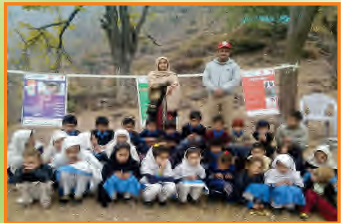
Health & Hygiene awareness session delivered by Pakistan Red Crescent Society to Community Feeder Schools of Muzaffarabad